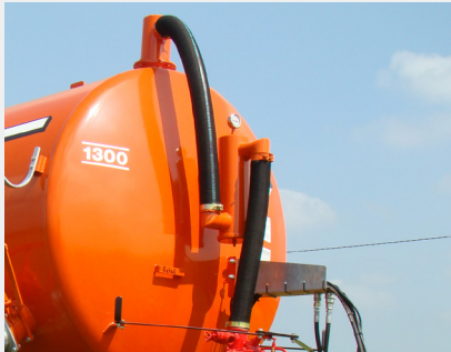
Double trap system