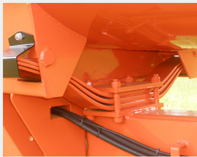
Parabolic leaf sprung drawbar