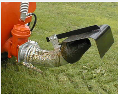
Inverted splash plate