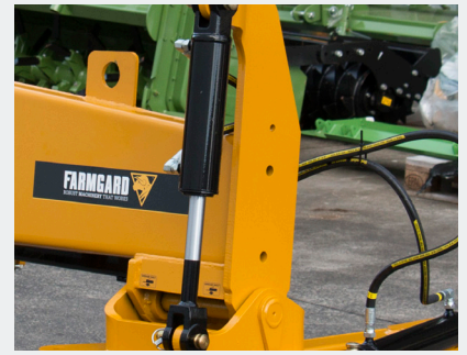
Bolt on land wheel bracket