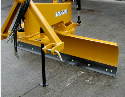
Massive depth to carry more soil