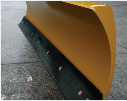
Manganese hardened steel cutting edge