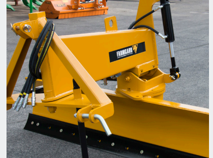
Tapered beam for extra strength