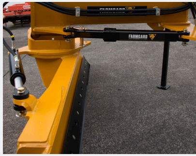
85% of total weight on cutting edge