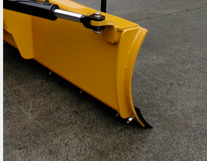
Double plated mould board