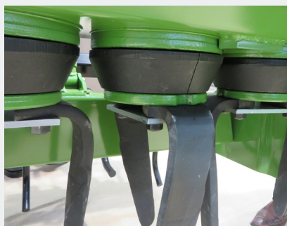
15° Rotor timing