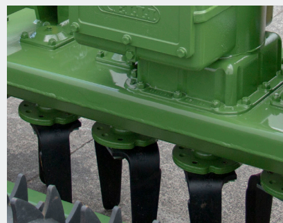
Fully welded geared