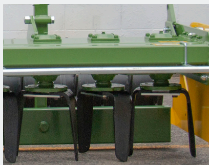
Wide spaced bearings on rotors