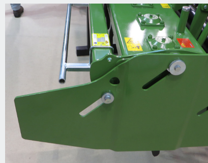
Extended Side Plates