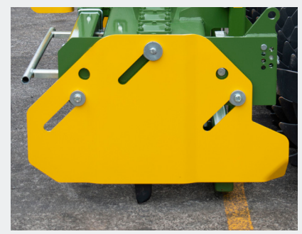
High resistant side plates