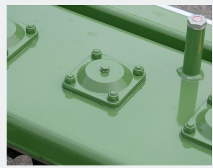
Greaseable top bearings