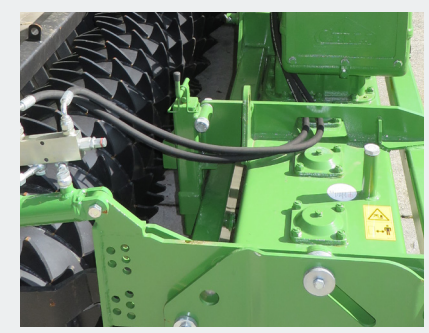
Leveling bar attached to gearbed