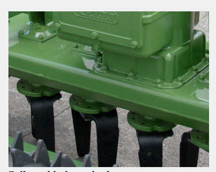
Fully welded gearbed