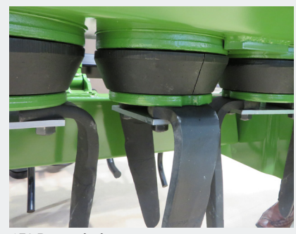
15° Rotor timing