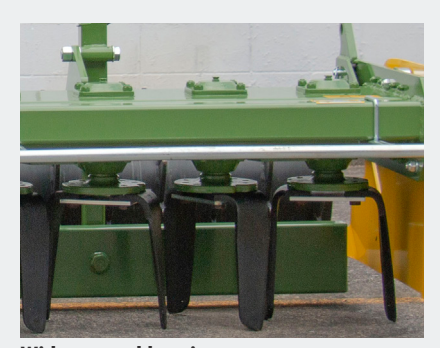
Wide spaced bearings on rotors