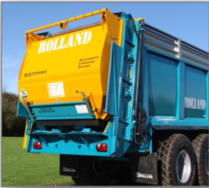
Beater frame TCE with 2 horizontal beaters and spinning deck, HARDOX wear plates