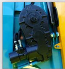
Bedchain driven by 2 reinforced gearboxes