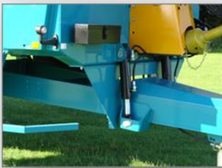
Drawbar with hydraulic suspension with accumulators for shock absorbers