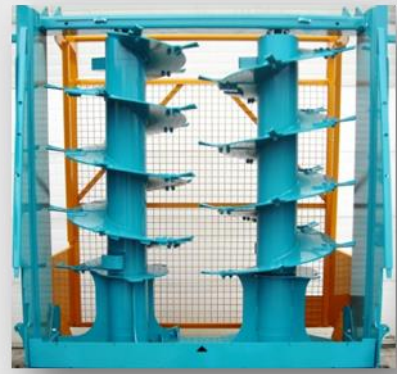
Frame with vertical beaters C10