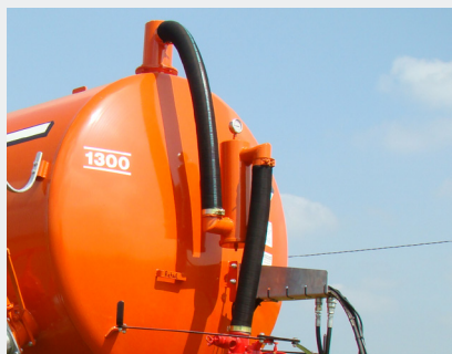
Double trap system