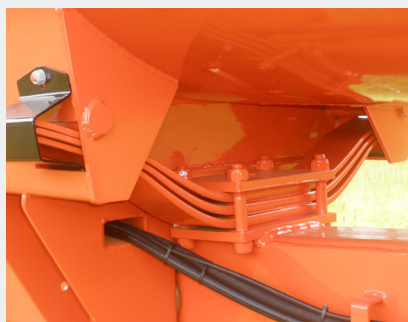
Parabolic leaf sprung drawbar