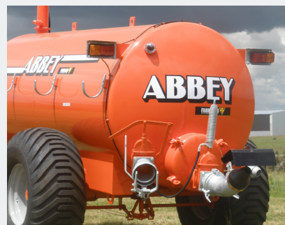
Pressed dome ends